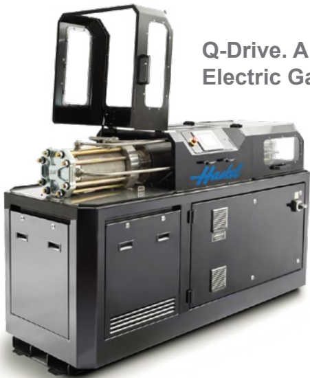
Q-Drive. A Smart, Revolutionary Electric Gas Compressor

Our reputation is built on safety, reliability, and quality, aiming to provide the highest level of service to maximize your assets' productivity and efficiency.