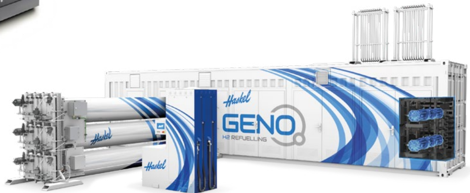
High Capacity GENO Hydrogen Refuelling Stations